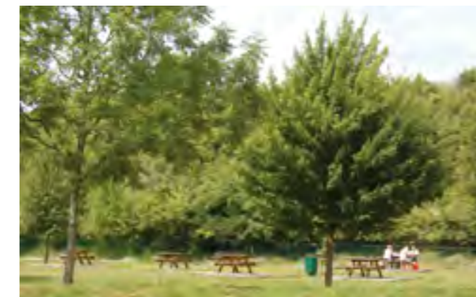
Picnic tables on the site.