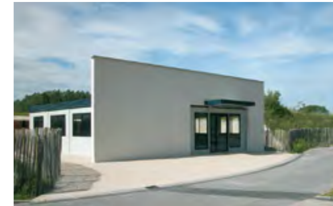
Picnic room on the site.

NATIONAL SEA EXPERIENCE CENTRE Boulogne-sur-Mer www.nausicaa.fr/